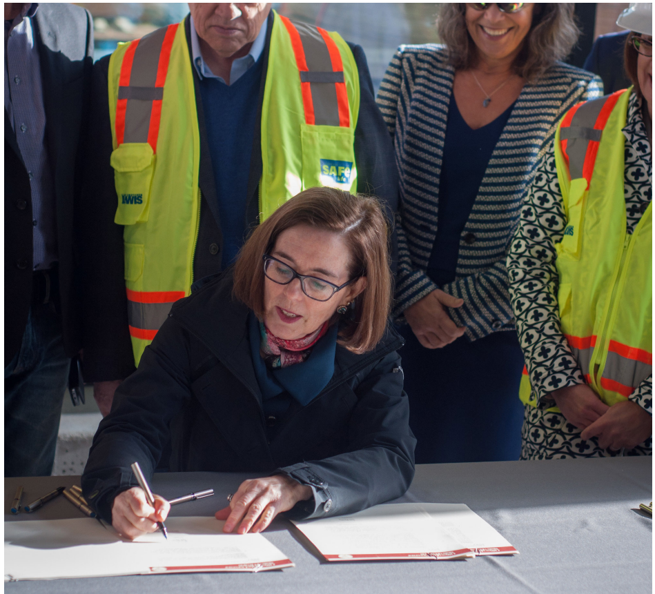
Governor Kate Brown signs Executive Order at National’s project, Field Office in Portland, OR, encouraging more energy efficient buildings.

and women who are paid fairly and who receive health and other fringe benefits produce and operate better built and better performing properties and stronger communities.